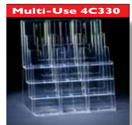
4 compartment A4 brochure holder (also for wall mounting) Opening dimension 230mm x 32mm x 4 Optional dividers allow for conversation to 8 pockets DL 1/3 rd A4