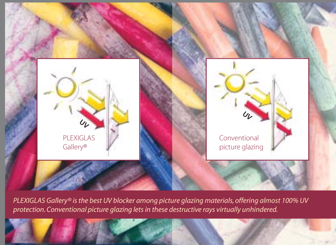
PLEXIGLAS Gallery® is the best UV blocker among picture glazing materials, offering almost 100% UV protection. Conventional picture glazing lets in these destructive rays virtually unhindered.