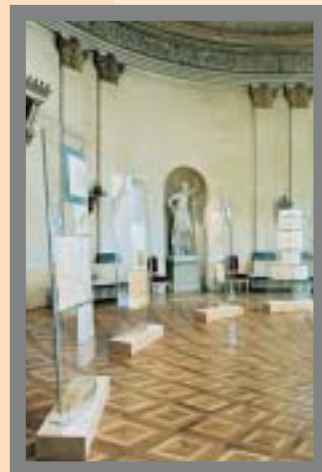
Applications for PLEXIGLAS Gallery®